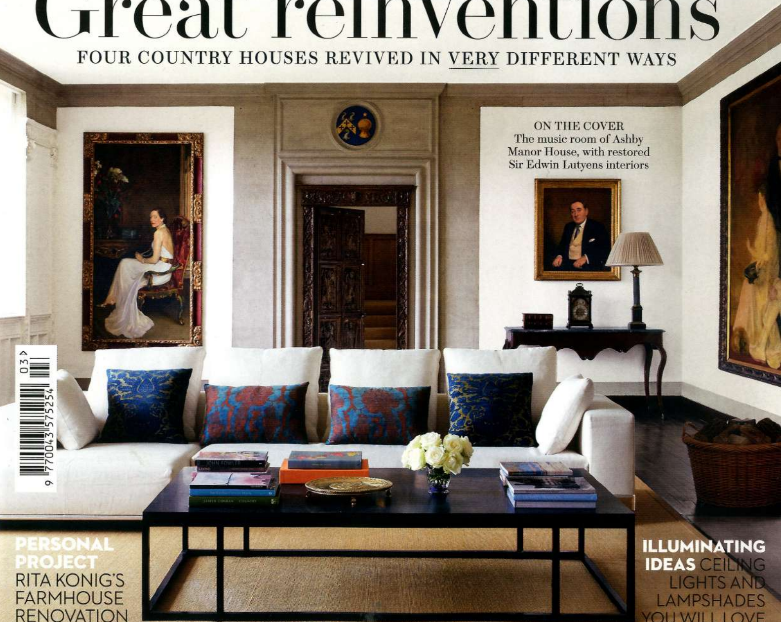
ON THE COVER The music room of Ashby Manor House, with restored Sir Edwin Lutyens interiors

FOUR COUNTRY HOUSES REVIVED IN VERY DIFFERENT WAYS